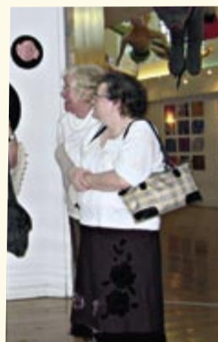
Learning new tricks!

On a roll, I found out about ACE, a community based Adult Learning Centre.